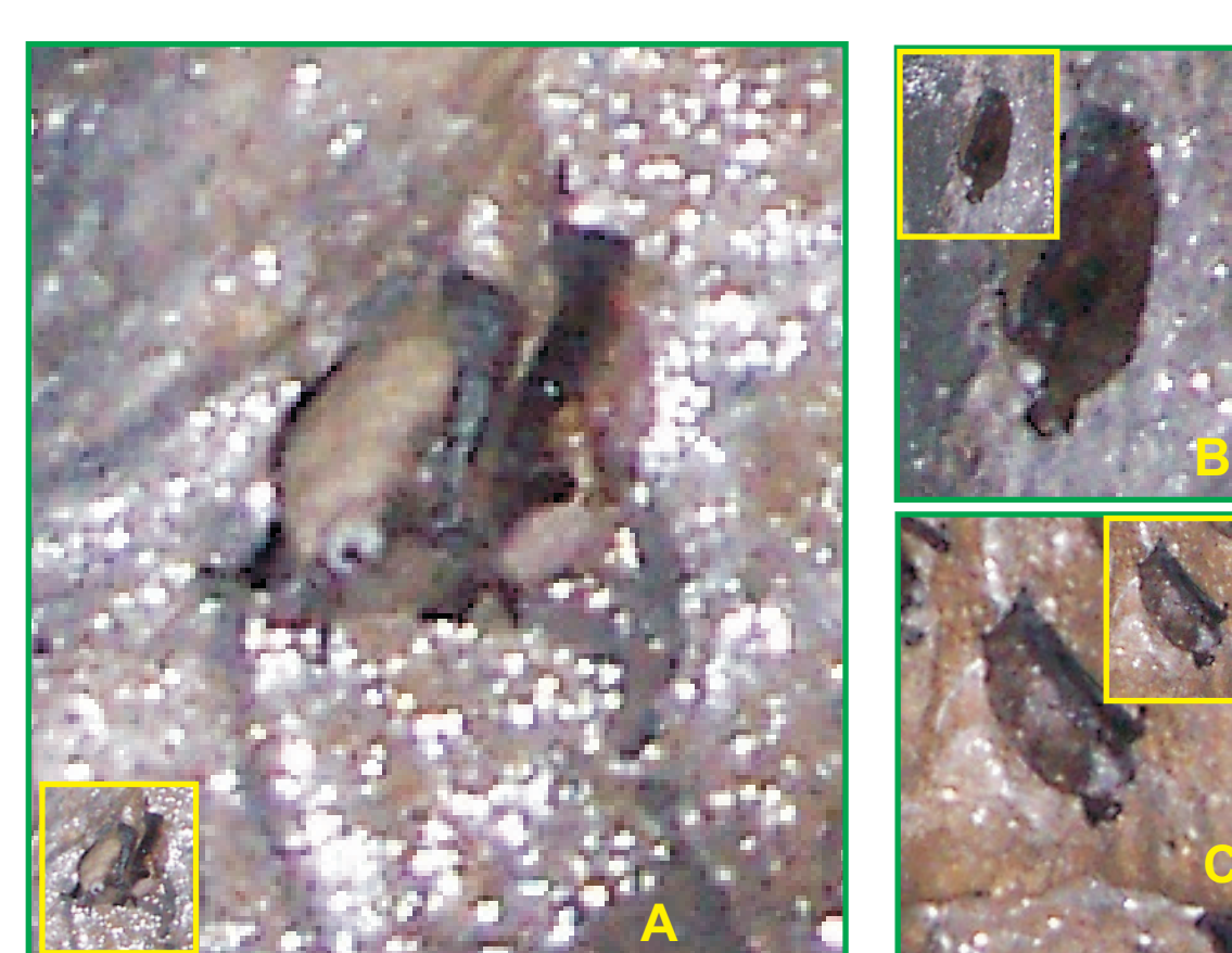
White Nosed Bat

Bats in this photograph taken on February 16, 2006 are the first documented instance of bats in a New York State cave with the White Nose Syndrome. A significant reduction in the bat population occurred in the lower non-commercial section of Howe Caverns between the winter of 2005-2006 and the winter of 2006-2007. Numerous dead and dying bats were observed in February 2006 in both the cave and quarry adit by Guenther and Rubin. By March 2006, the population of living bats was severely impacted. Very few bats were present during the winter of 2006-2007, indicating that a massive die-off had occurred.